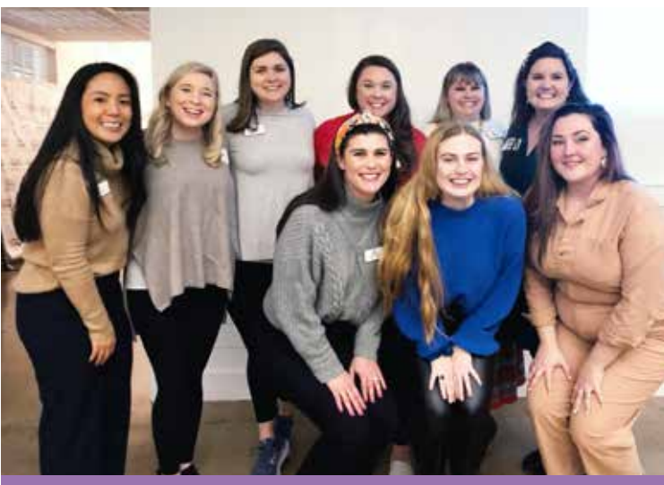
League Members for a General Membership Meeting, 2022