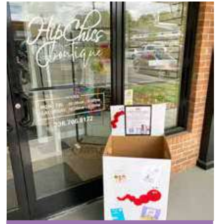
Spring 2023 Book Drive