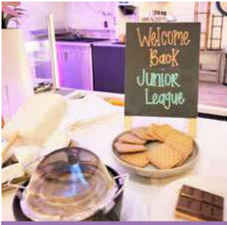
Spring Social at the Ginger Fox, March 2023