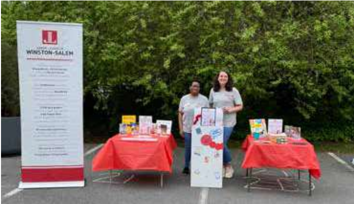
BookWORM at the Spring Moms at the Market at Buie's Market

The Junior League of Winston-Salem (JLWS) aims to help families gain greater access to books through BookWORM, a drive to collect new and gently used children's books from its members and the greater community. BookWORM works with community partners to distribute donated books to children in our area. Community partners are local organizations that receive our books based on our common goal of promoting literacy. Some of our community partners include: Brenner's Children's Hospital, Family Services of Forsyth County, Imprints Cares, LEAD Girls of NC, Novant Health First Steps, Read Write Spell, Ronald McDonald House Downtown Health Plaza, Winston-Salem/Forsyth County Schools, and other organizations that promote early childhood development through access to books.