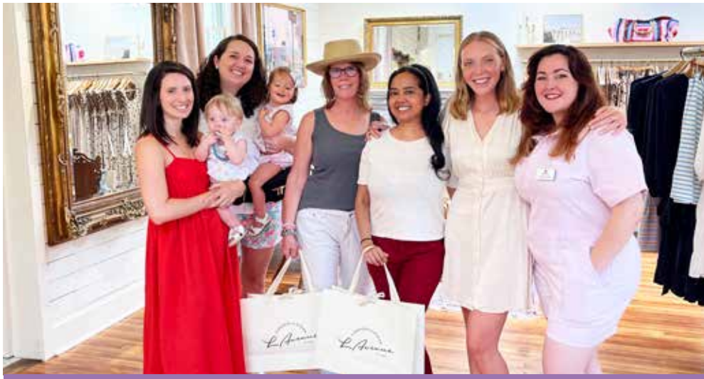
Shopping event at L'Avenue Boutique to benefit the Annual Fund, July 2023