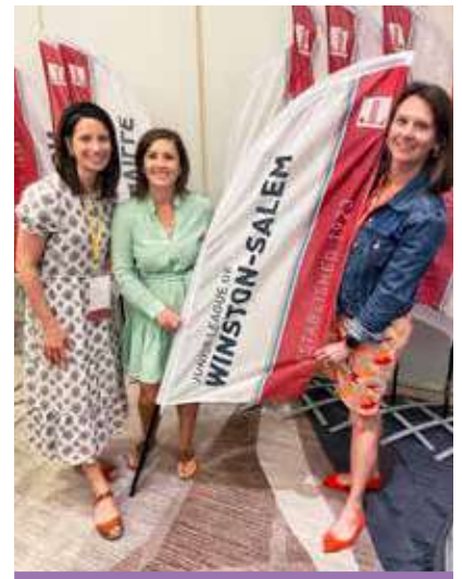
2023 Association of Junior Leagues International