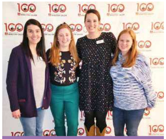
January 2023 General Membership Meeting