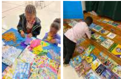
BookWORM at Strong Women, Strong Families Event at Cook Elementary School

Strong Women, Strong Families events strive to improve the health profile of the community with the goals of facilitating relationships with the medical community, educating the community on healthy food preparation, and providing a meal.