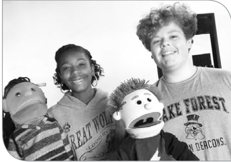
We did not plan - but how adorable are these RJR students! The resemblance is fabulous!

The Junior League of Winston-Salem's longest running placement, the JLWS Puppet Show, "You Can Always Talk to Someone," has had a busy fall. The program's script was updated and the