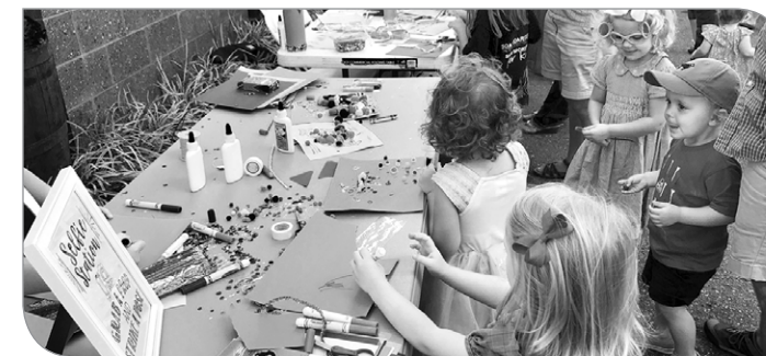
The children's craft area was a popular place. Glitter, glue and markers — who couldn't resist?!